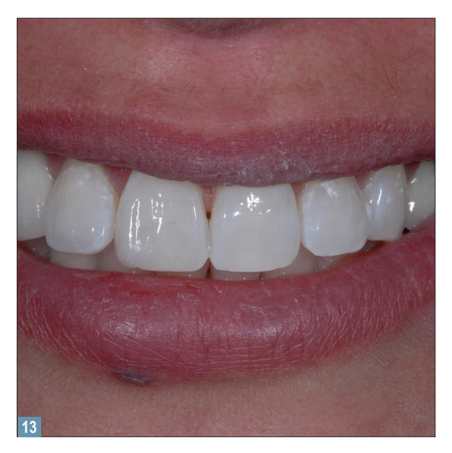
Fig 11. Postoperative photograph showed seamless, undetectable transition from tooth to restoration. Fig 12. After whitening and prior to composite augmentation. Fig 13. Patient's smile after whitening. Note the minimally invasive, imperceptible restorations.

stain on the teeth was removed with pumice on a soft prophy brush. Shade selection and mockup was immediately performed. Shade selection was accomplished by curing small increments of enamel shades (Filtek<sup>TM</sup> Supreme Ultra A1E and B1E, 3M ESPE; Premise<sup>TM</sup> B1E, Kerr Dental, www.kerrdental.com; and IPS Empress® Direct B1E, Ivoclar Vivadent, www.ivoclarvivadent. com) onto the teeth to be treated. In this case, IPS Empress Direct demonstrated the best match to the surrounding tooth structure.