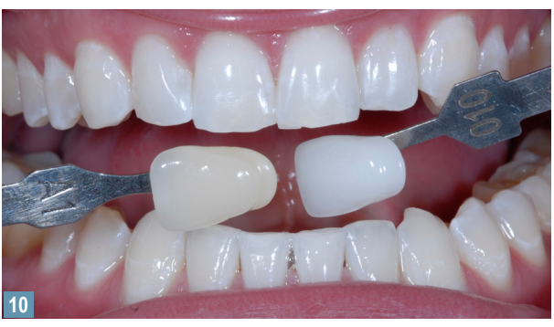
Fig 7. At initial presentation, note the fractured, yellowed teeth. Fig 8. The at-home trays, containing a desensitizing and remineralizing gel, were placed immediately after the Zoom whitening was completed. Fig 9. After whitening has been completed, the patient was ready for the composite restorations, which will address the fracture lines and the multicolored pre-existing condition. Fig 10. The palatal wall was initially built with a bleach LE shade to mimic the incisal halo before the final facial layer was placed.

that the teeth whitened all the way to the 010 whitening shade tab. The dentist and team should show excitement over the results, re-emphasize them, and show the patient the photographs. Patients are then told they will receive the photographs via email and are encouraged to share them with friends and post them on social media.