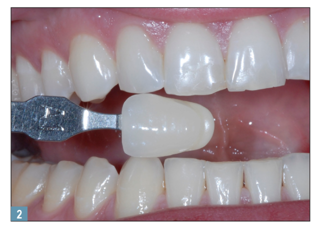
Fig 1. Preoperative photograph with shade guides at the lower lip line. Fig 2. Preoperative whitening photograph with shade tab that matches pre-existing color.

between six and nine shades on the shade guide, but the light-activated systems can provide an additional one to two shade guide improvements over non-light-activated systems.<sup>6,7</sup>